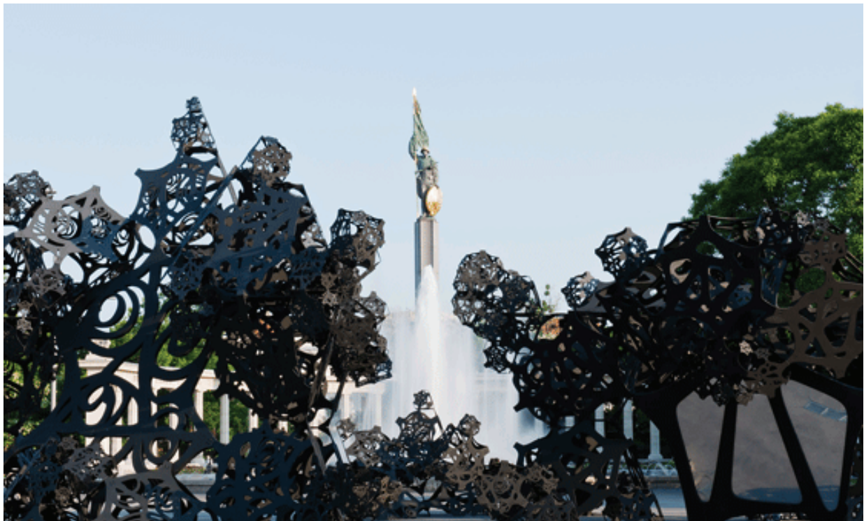
The Morning Line Vienna, 2011 - Photo: Hertha Hurnaus / T-B A21

T-B A21 Himmelfortgasse 13 1010 Vienna, Austria